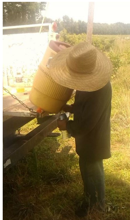
A child worker getting water.

At Kinston Community Health Center, non-judgmental attitudes are a requirement. Many of our outreach workers have some experience with agricultural work. We understand the social determinants that can lead to the need for children to work in agriculture. Our efforts ensure all children receive appropriate care.