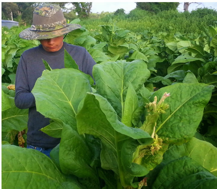
A child working in a tobacco field.