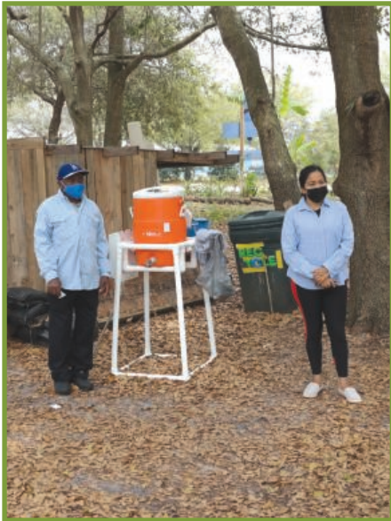
Keep 6 feet between you and your coworkers.