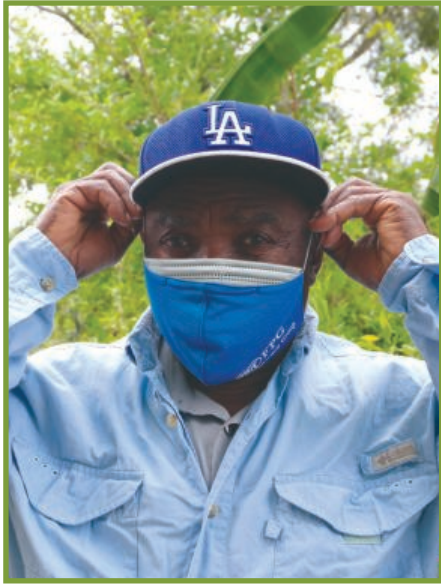
To keep your family and community healthy, always wear a mask.