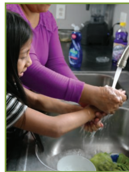
Wash your hands frequently with soap and water.