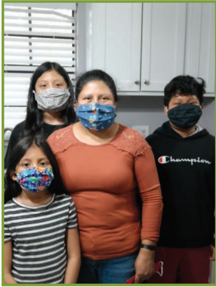
To keep your family and community healthy, always wear a mask.