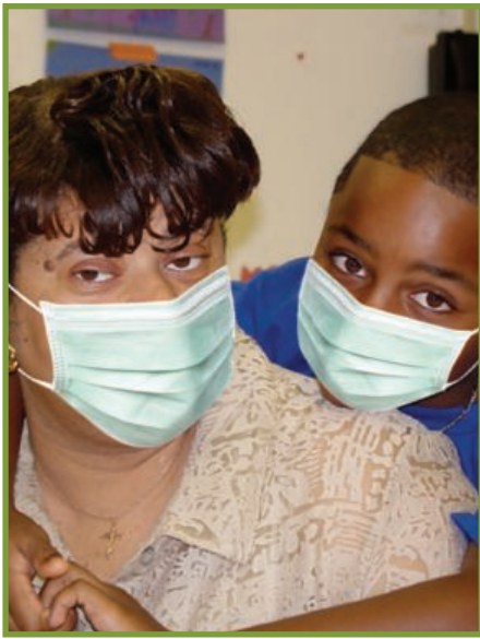
To keep your family and community healthy, always wear a mask.