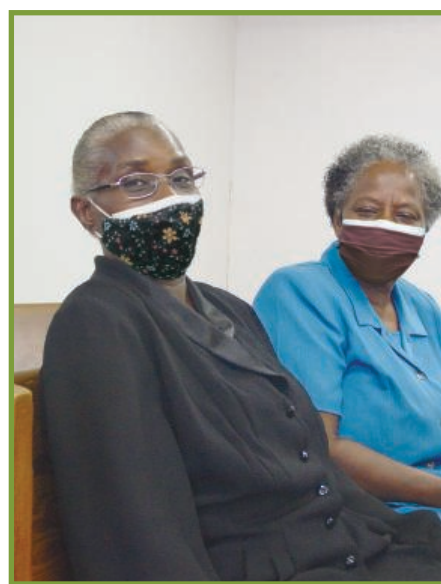
When visiting others or in your place of worship, wear your mask and sit close to only those you live with.