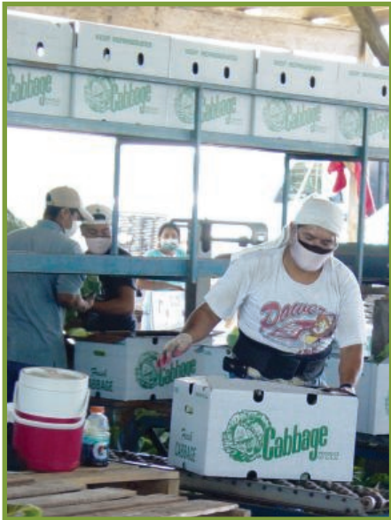
Stay 6 feet away from others, even when wearing a mask.