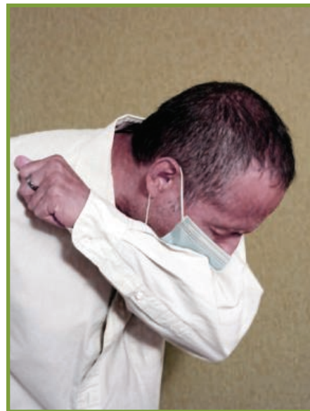
Sneeze into your elbow, never into your hands.