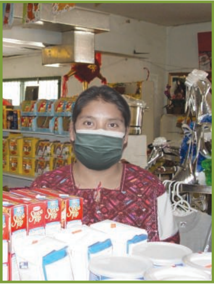
Always use two masks to cover your mouth and nose when in public.