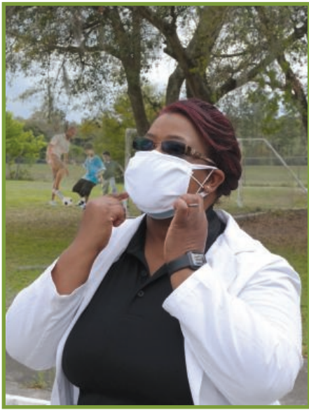
Always use two masks to cover your mouth and nose when in public.