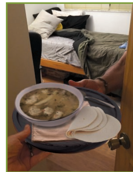
If sick, stay in a separate room, even for meals.