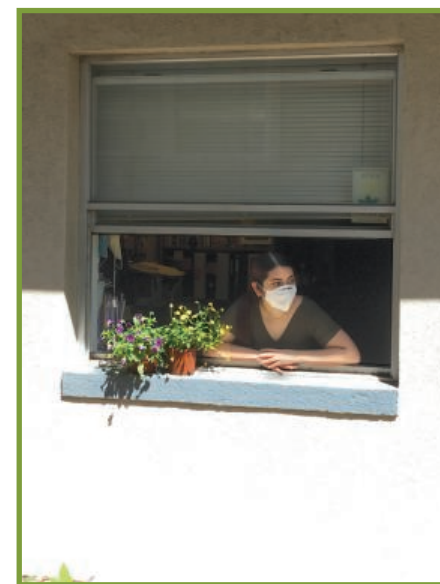
Keep windows open when indoors with others.