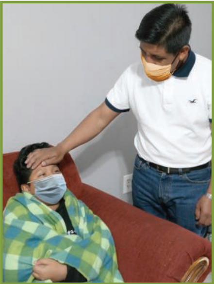
Wear a mask if you are caring for someone with COVID-19.