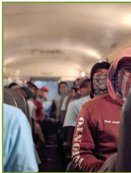
Keep your mask on and windows open in shared transportation.