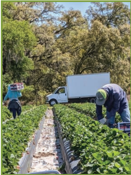
Keep 6 feet between you and your coworkers.