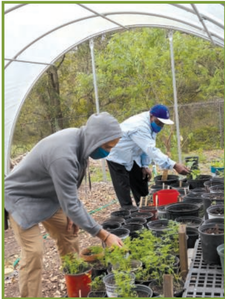
Stay 6 feet away from others, even when wearing a mask.