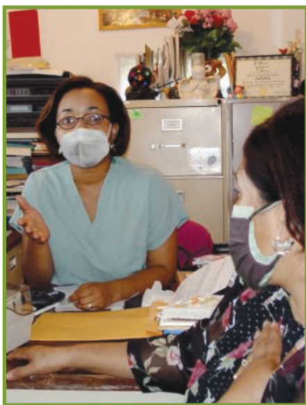
Talk to a medical provider if you have questions about the vaccine.