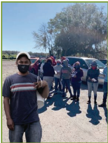
Stay away from crowds.