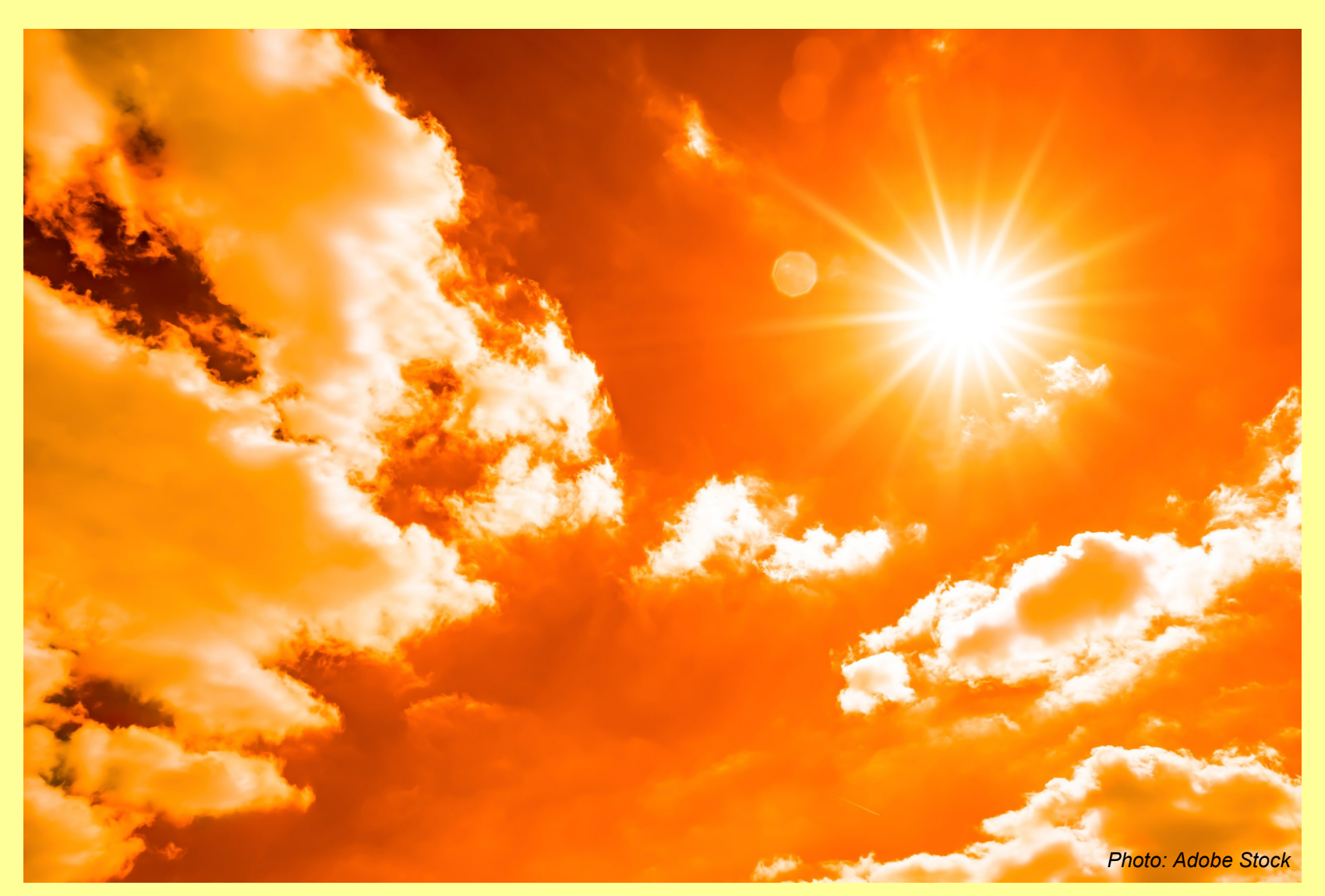
Direct sun exposure increases the risk of heat stress.