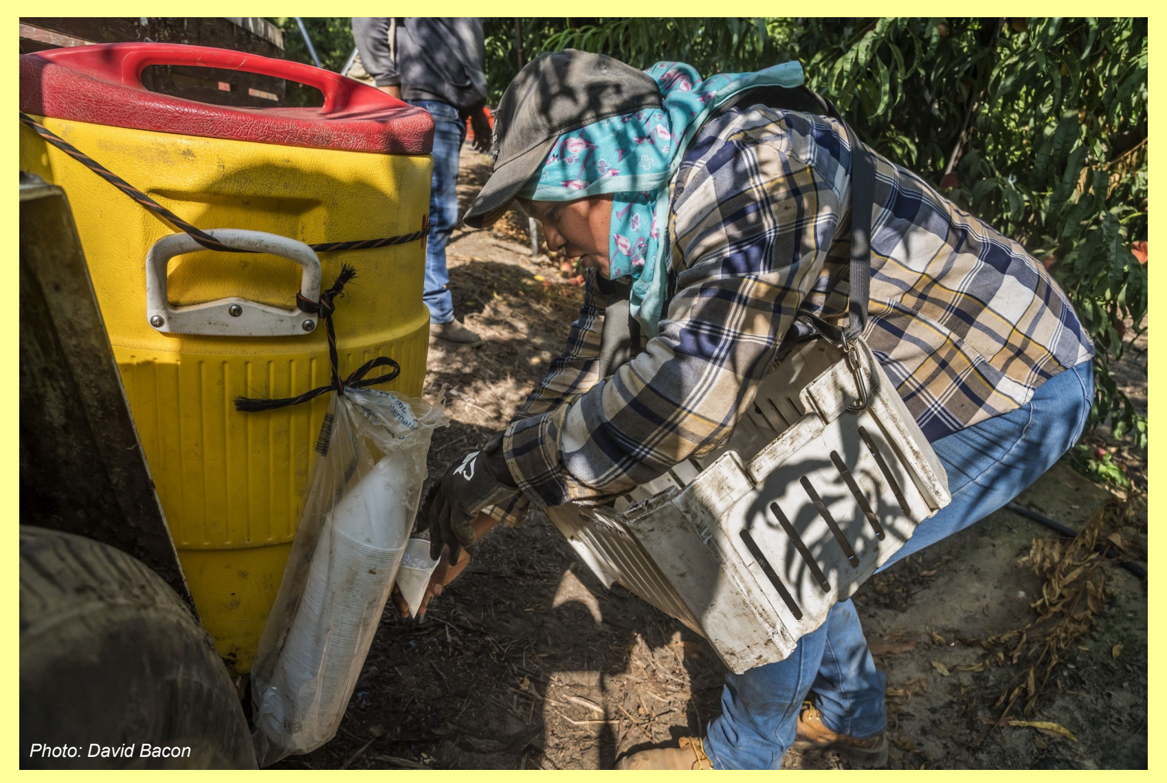
Don't wait until you feel sick to drink water.