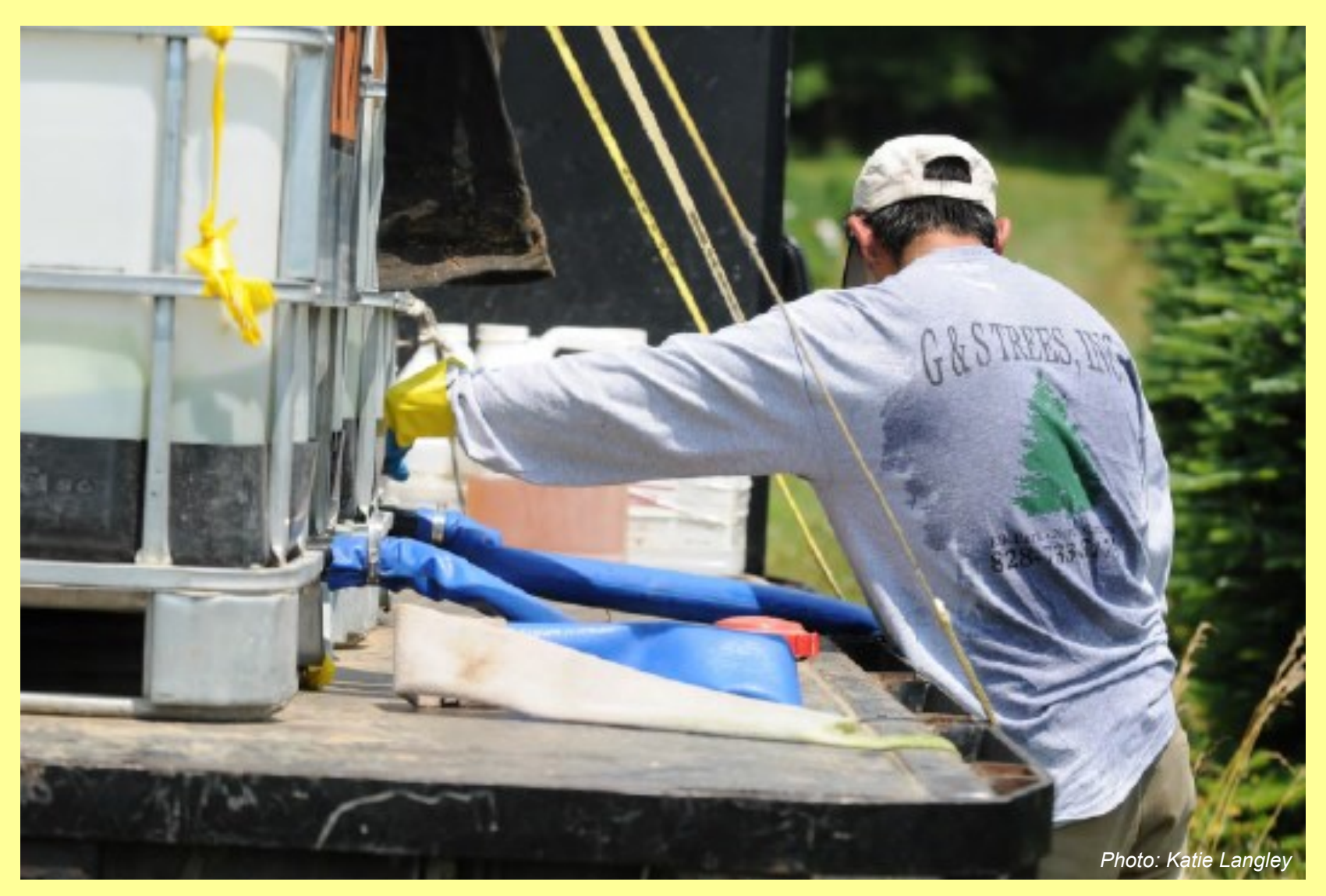
Farmworkers are at high risk of heat stress.