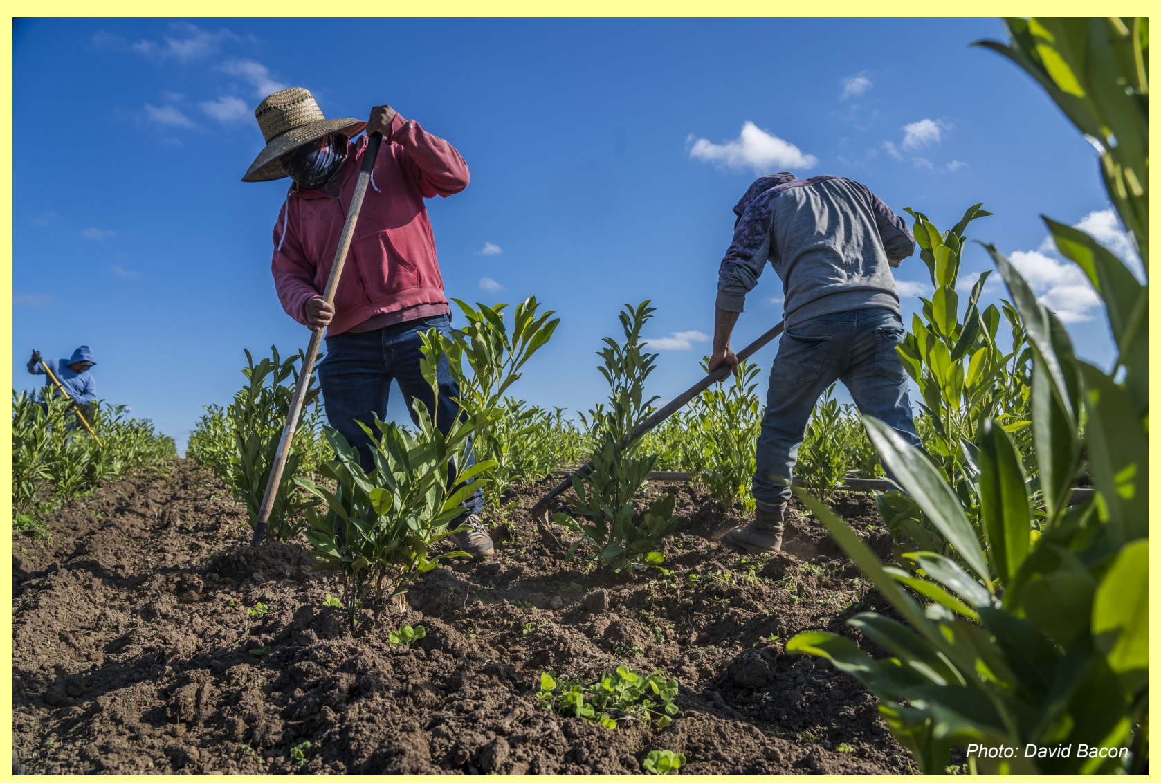
Farmworkers laboring in the midday sun.