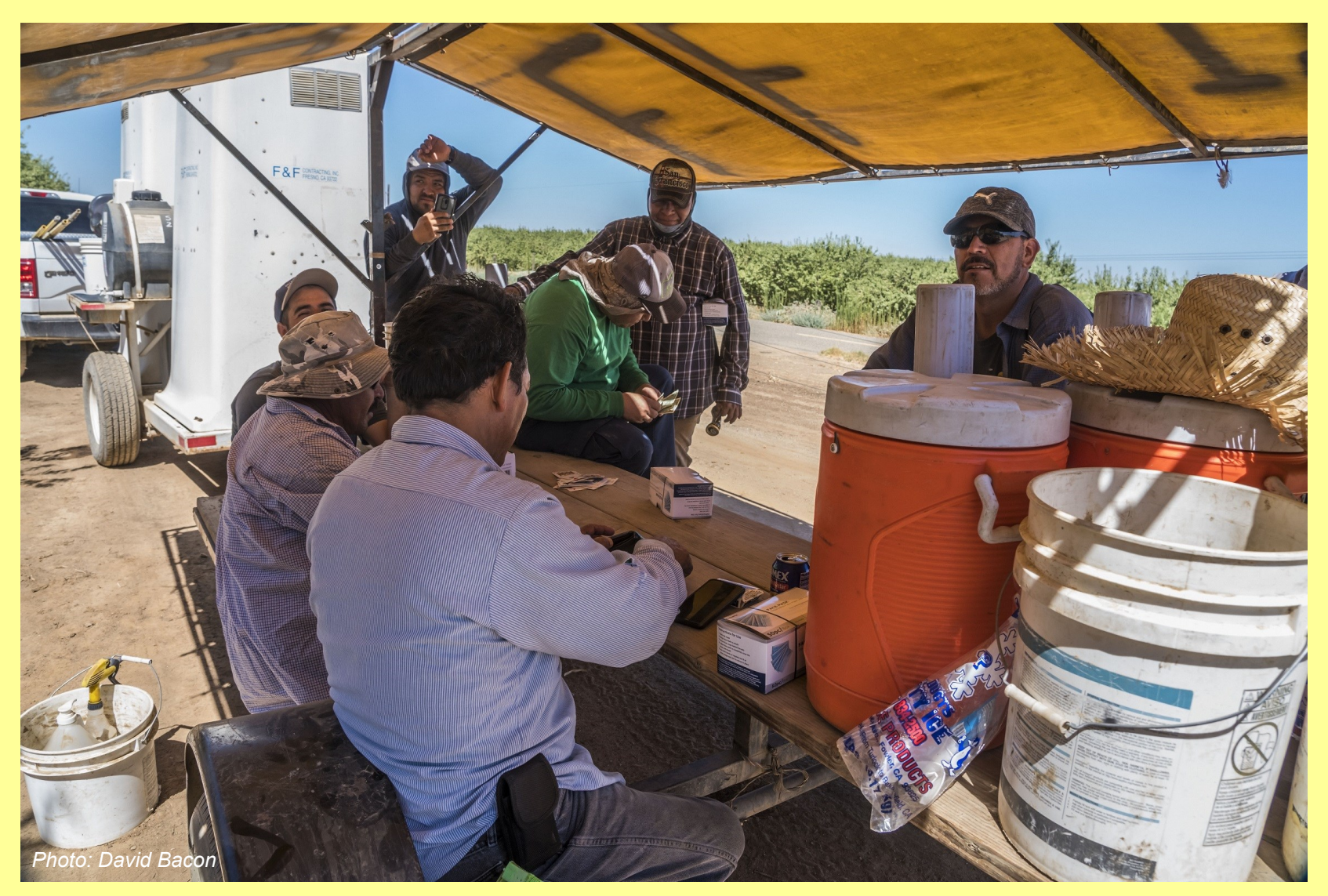
Farmworkers taking a rest break in the shade.