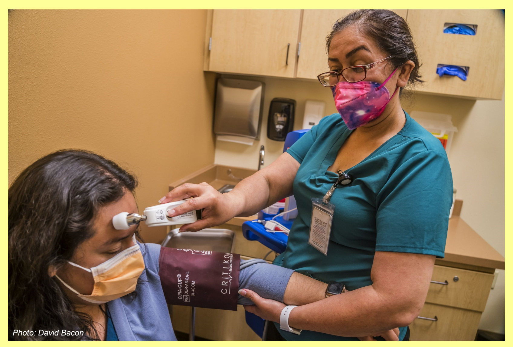
More serious symptoms of heat illness require medical attention.