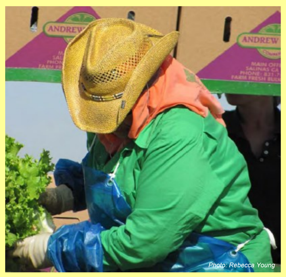
Farmworker wearing sun protection and personal protective equipment.