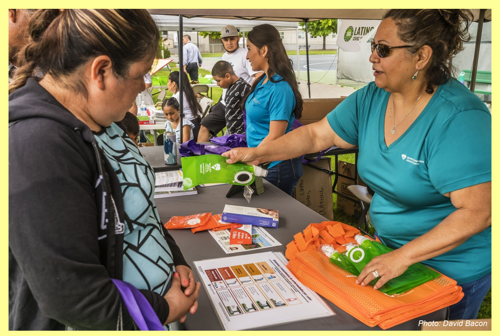
A community health worker does outreach on heat stress safety in Quincy, Washington.