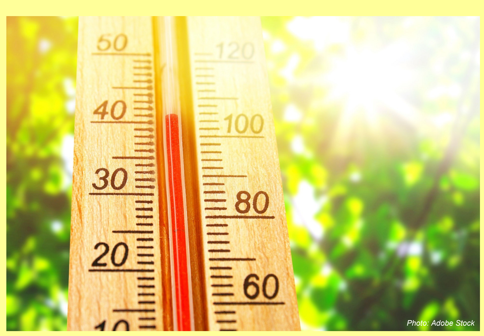
High temperatures put workers at risk of heat stress.